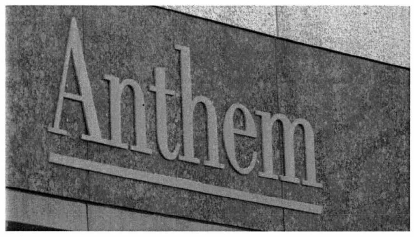
The Anthem logo at the company's corporate headquarters in Indianapolis. Anthem cut two planned premium increases after California regulators challenged its estimates of drug expenses.